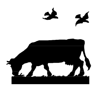
There are concerns for our export industry based upon our clean, green image.

Taken from Press Release - "Legal Action May Block GE Risk to Dairy Industry", GE Free New Zealand, 29 August 2000