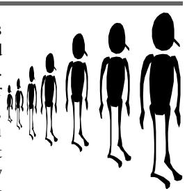
The strength of public opinion is very powerful. It has the ability to make real changes.

So get your pens and paper, and get writing. Te11 your friends, family, everyone you know and let them know about the power that they hold to make a real dif-