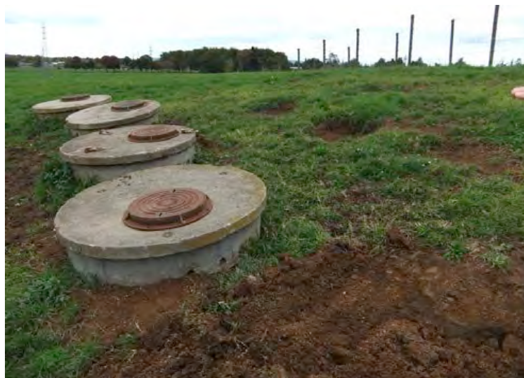
Figure 8: Carcass pit covers and subsidence holes

GE Free NZ applied under the OIA to obtain the HGT report from ERMA, who had not seen it, so the request was transferred to AgResearch.