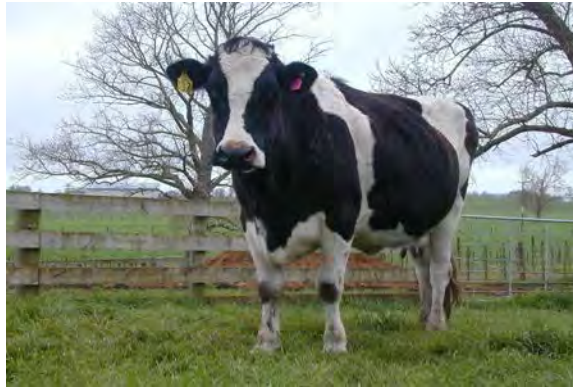
Figure 3: AgResearch transgenic cow

Myelin Basic Protein (rhMPB) cows 24 – These cows' milks express a recombinant human Myelin Basic (rhMBP) protein, to be used for pharmaceutical drug development. Myelin Basic Protein is the major protein constituent of the myelin sheath that surrounds the nerves. Demyelination of these sheaths occurs in illnesses like multiple sclerosis.