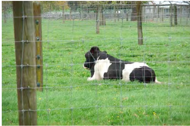
Figure 5: Follicle stimulating hormone calf

In November 2005, under a delegated approval, the Ruakura Animal Ethics Committee (RAEC) approved the trial to produce cows expressing milk that contained copies of the transgenic human follicle-stimulating hormone (rhFSH) gene for drug therapy. Normally, FSH is produced and secreted by the ovaries and testes and regulated by the anterior pituitary gland, it is essential for the development, growth, pubertal maturation, and reproductive processes of the mammalian body. Trials on the rhFSH 33 did not lead to an improvement of conventional or sperm parameters or an increase in pregnancy rates.