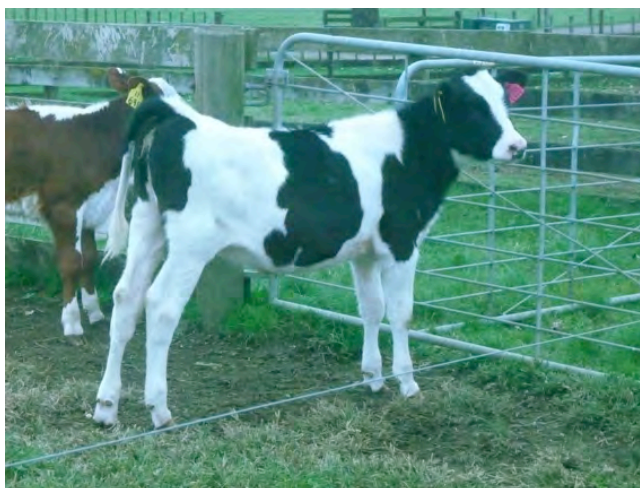
Figure 6 "Erbie" with non-transgenic friend

Erbitux is a pharmaceutical drug available on the market for the treatment of cancer. 43 In 2009, transgenic Erbitux nuclear transfer embryos were developed and up to four runs of embryo's implanted into recipient cows with no pregnancies resulting.