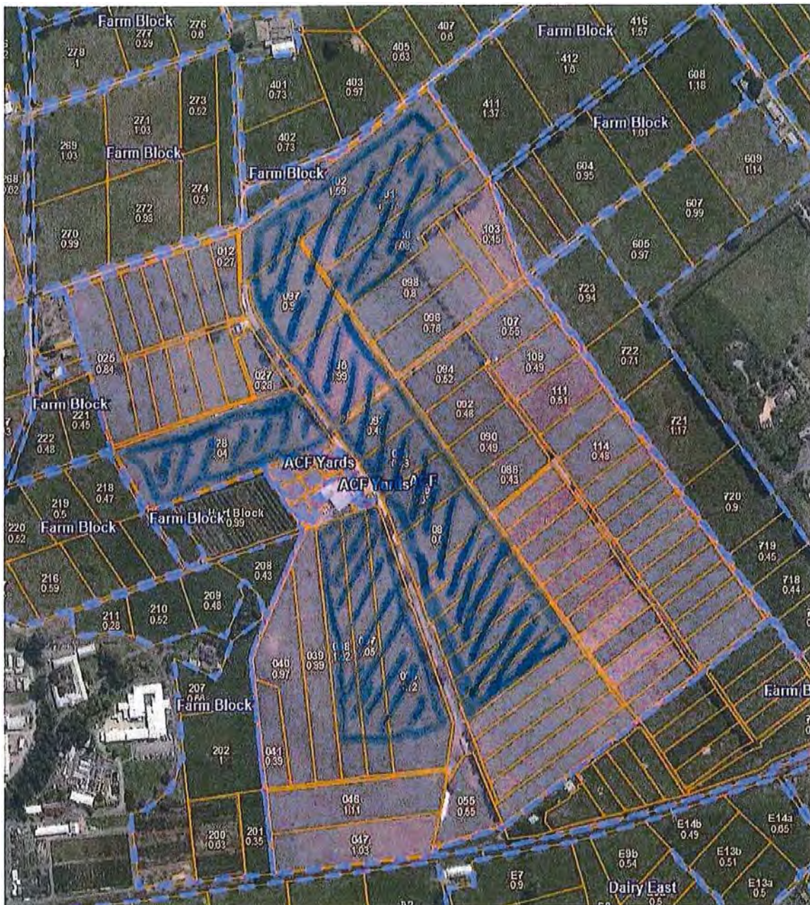
AgResearch GE Animal containment facility showing discharge of waste products.

AgResearch Ruakura Facility (dotted purple), the GE animal containment area (pink), area where transgenic milk and blood products are sprayed (stripped lines). (See picture below)