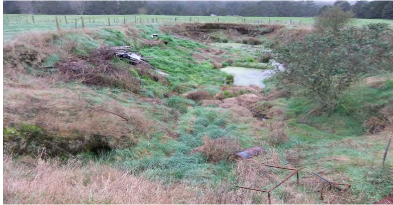
Figure 1: Whakamaru GE sheep ash disposal pits 2014

In 1997, ERMA formally approved the Mitchell Partners – PPL Therapeutics NZ transgenic sheep trial, application GMF98001 7 located on 500 acres in Whakamaru. A flock was to be developed from the earlier importation of transgenic rams carrying the recombinant human alpha-1-antitrypsin (rhAAT) genes, from a “Danish woman”. The transgenic ewe progeny were to express rhAAT protein in their milk, which would then be isolated from the sheep milk, to develop an experimental drug for patients with cystic fibrosis. The trial had permission to establish a manufacturing flock of 10,000 sheep. The flock grew to over 3000 transgenic ewes in the 7 years.