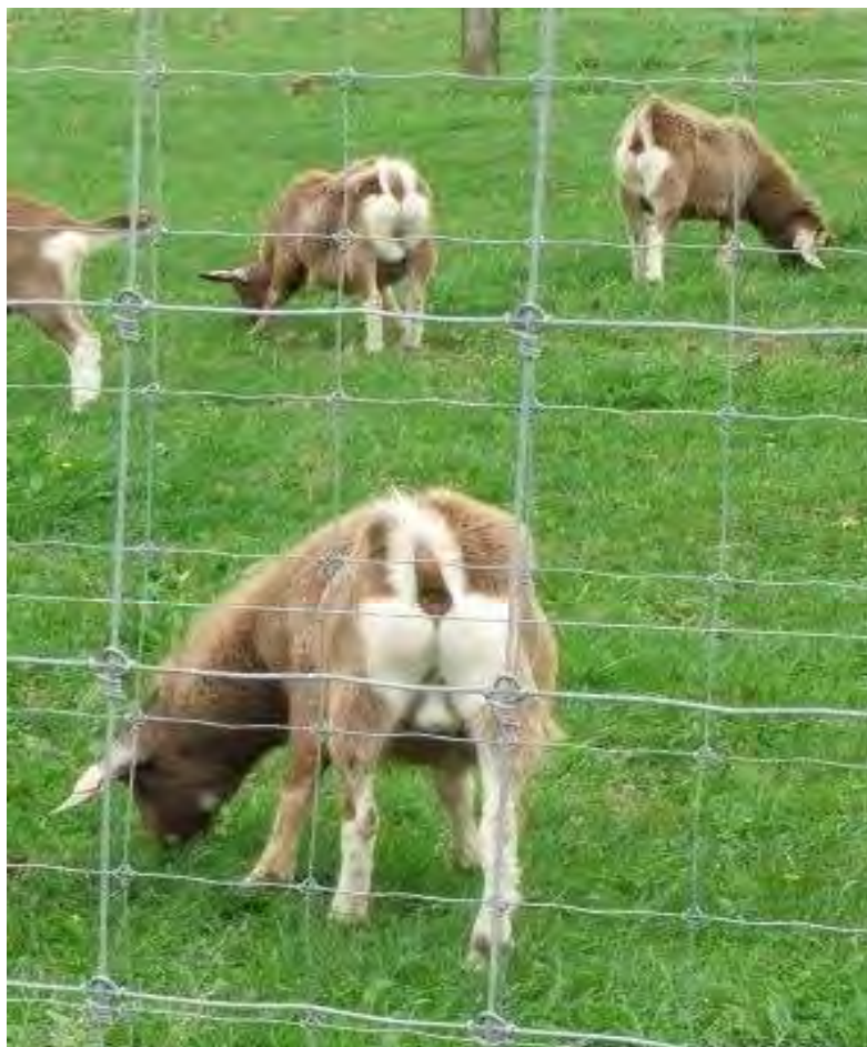
Figure 9: Sterile female goats with male genitalia

The 2014 Annual report records embryo survival to term was 4 out of 37 (11%) however 1 out of 37 (3%) of kids survived.