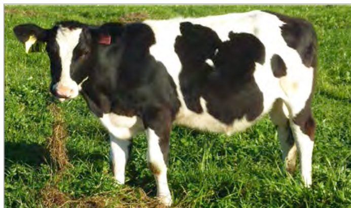
Figure 2: Daisy

Beta-lactoglobulin knockdown (BLG-) trial - in 2000, ERMA approved the Beta-lactoglobulin knockdown (BLG-) trial the cow's milk expressed no Beta-lactoglobulin(BLG-) protein. The approved method failed to create viable embryos.