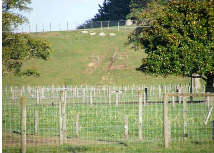
Figure 7: Carcass pits

AgResearch is required to conduct horizontal gene transfer (HGT) testing on the carcass pits where dead animals are buried, but not the fields where they spray the waste milk and blood products, as part of the reporting requirements. The pits are situated at the top of a hill.