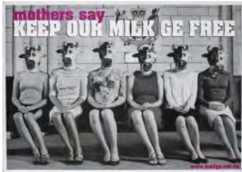
Figure 4: MAdGE poster Keep our milk GE Free

There have been three pharmaceutical constructs developed under this approval.