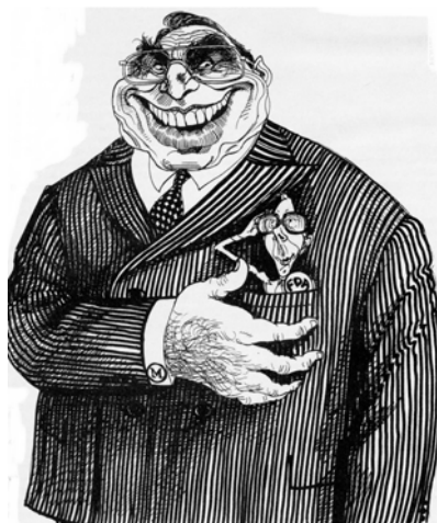
Monsanto - too cosy with the Food & Drugs Administration

Disclaimer- We are not liable for any error, omission, fact or misinterpretation in this publication, nor any action taken on the information given.