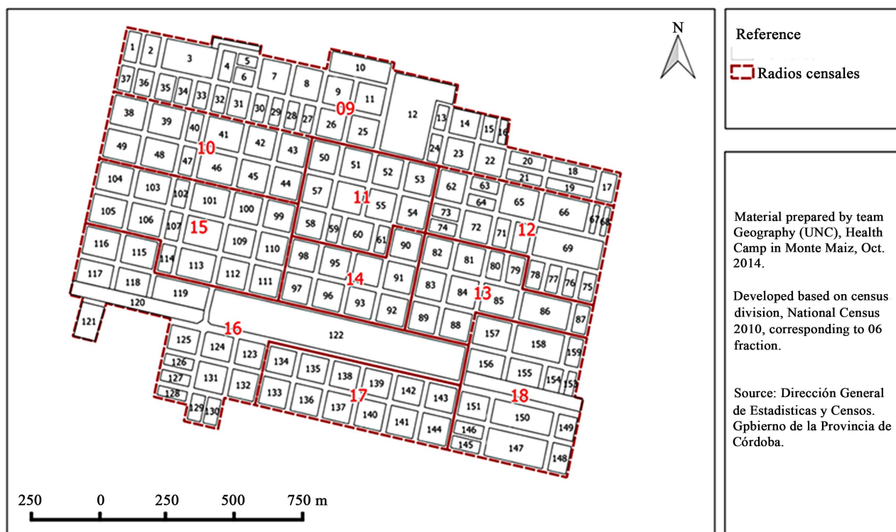
Figure 1. Map Ratius Census of Monte Maíz by National Institute Census divide the town in nine sectors outweighed demographically.