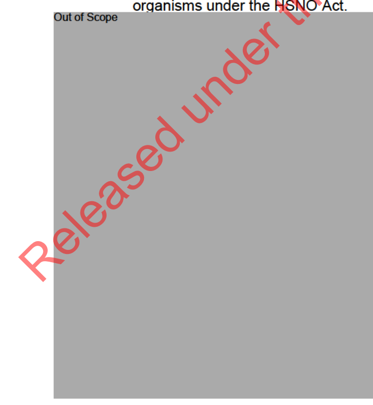
Pages 5 - 14 have been removed as they are Out of Scope of this request

In 2020, FSANZ will prepare a proposal to amend definitions relating to gene technology. Ministry officials will stay up to date with this work, and engage with FSANZ and MPI as appropriate, given the similar situation we face in the regulation of genetically modified organisms under the HSNO Act.